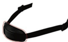
PN 533 with Webbing Cradle and Chin Cap