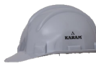
PN 527 with Plastic Cradle, with Peak and Y-type Chin Strap