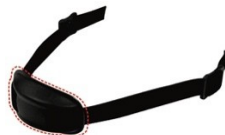
PN 523 with Plastic Cradle and Chin Cap