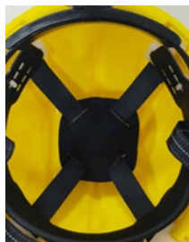
PN 531 with Webbing Cradle