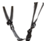
PN 536 with Webbing Cradle, without Peak and Y-type Chin Strap